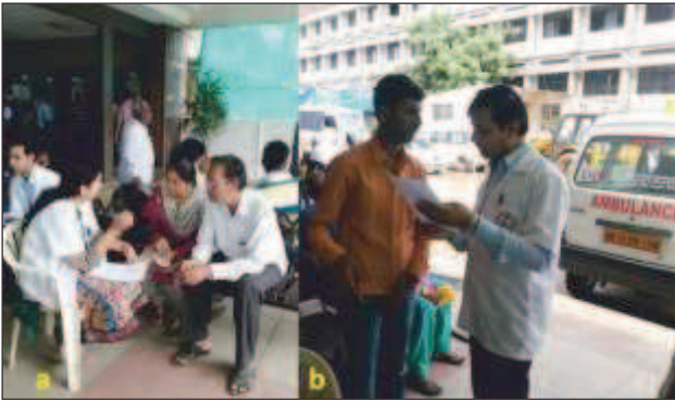
Figure 1 (a,b) : The photograph shows 2 of our researchers talking about the questionnaire with the respondents during Part I of the study.