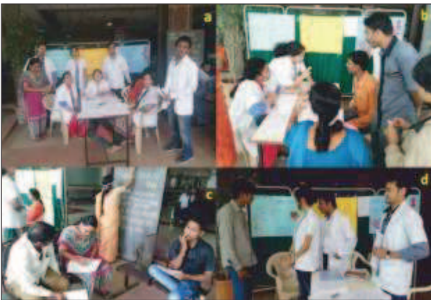
Figure 2 (a,b,c,d) : These figures show the researchers during Part II of the study, (a) showing our team, (b,c,d) showing team members discussing various aspects of Organ and Body donation with the respondents. Also seen in the background in (d) are the posters created by our interns which they can be seen explaining to one of the respondents.

percentage i.e. 39% stated that they had no idea about brain-death. Wig et al state that discussion with the grieving relatives regarding organ donation following brain-death, is very difficult.[10] If the relative is unfamiliar with the concept of organ donation following brain death, the discussion process becomes even more challenging. Awareness among relatives about the process of brain death and related organ donation and transplantation will ease the way for the discussion process. Dolatabadi et al carried out a before-after study about brain-death and organ donation on attitude and knowledge of the participants and found that the group which underwent educational session had a significant improvement in attitude and knowledge after the training session compared to the control group.[11] Thus educational